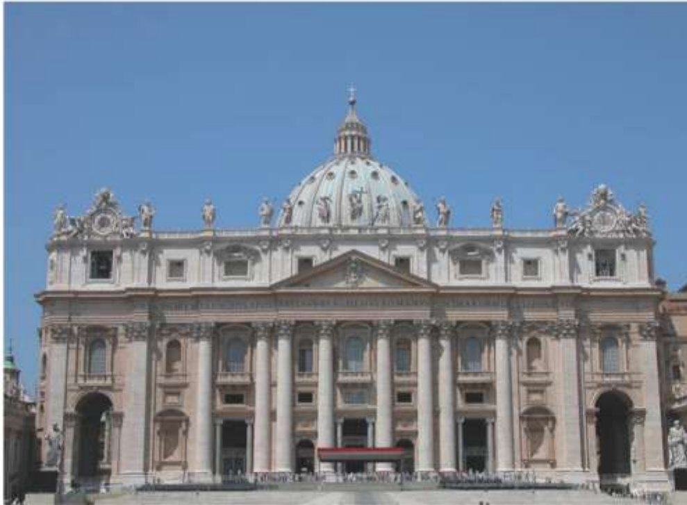
Saint Peter's (the Vatican, Rome )