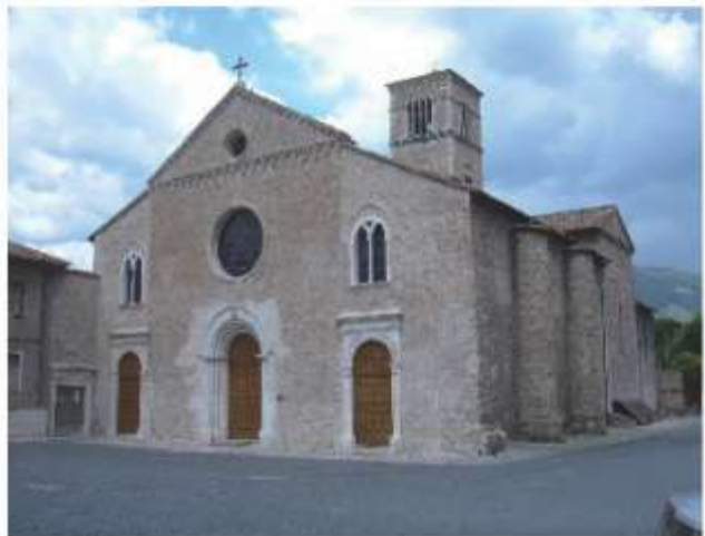
Terni Chiesa San Francesco