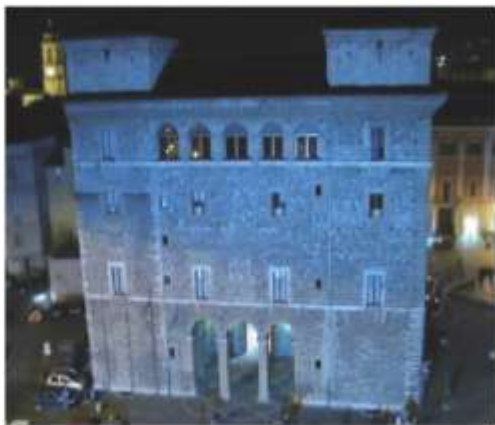
Terni Palazzo Spada

But above all, St. Valentine refused to recant his faith and openly tried to convert Roman emperors from Claudio the Goth to Aurelian. Because of this history, no one in Terni is indifferent to the date of February 14.