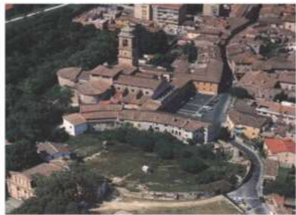
Terni Anfiteatro Romano

The Cathedral (il Duomo) was rebuilt in the 17 th century but retains, under the portico that precedes it, a beautiful Romanesque portal with reliefs (12 th century) and a second Gothic portal. The Civic Museums are housed in Terni in the palazzo Fabrizi, which reassembles facades of factories from the 1700's. The archaeological collection includes a necropolis from the Iron Age, ancient Roman and medieval inscriptions. The municipal art gallery contains religious works dating from the 14 th to the 18 th centuries, such as those of Nicholas Alunno, Francesco Melanzio, Domenico Alfani, Arrigo Fiammingo, Benozzo Gozzoli, the triptych "Madonna and Two Saints" by the Master of the Dormitio of Terni, the triptych "Madonna Enthroned with Saints" by Matteo d'Amelia, as well as works by modern artists (Sassu, Miro, Carra, Picasso, Campigli, Severini and painters of the Ternana School, of group of artists working in Terni, 1930-40.