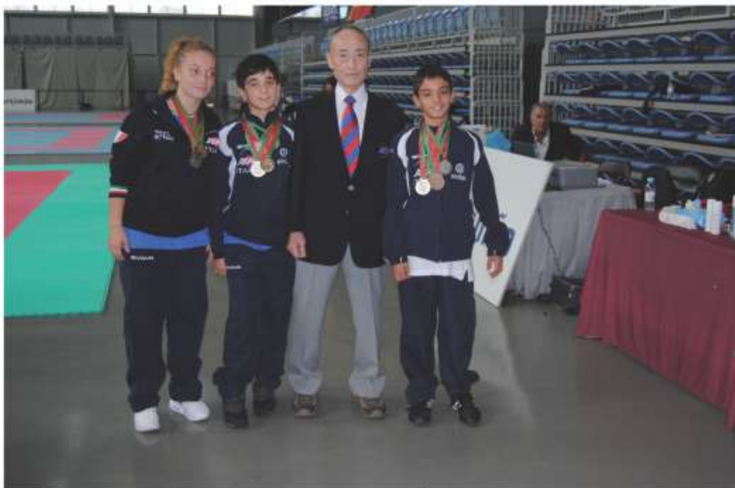
Italian national Juniors team competitors in Jska world championship in Portugal 2010