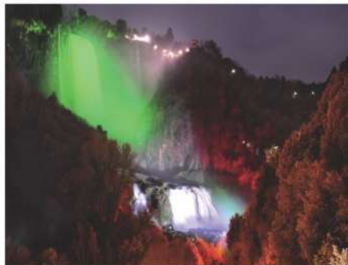
Waterfalls Marmore Italian flag for the 150th anniversary of the Italy unification