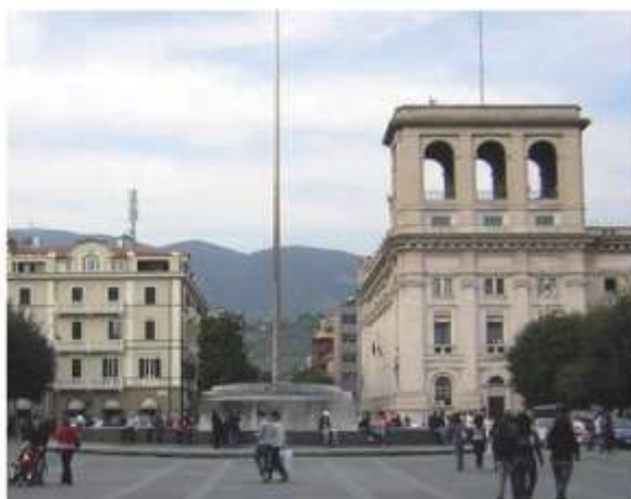
Terni Piazza Tacito